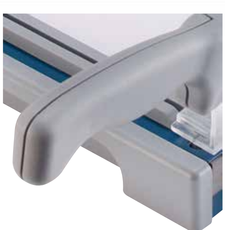
Ergonomically shaped handle to prevent tired hands while cutting