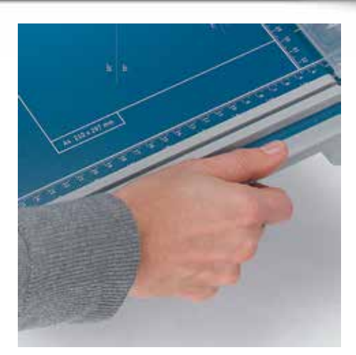
Practical recessed grips for safe and easy handling